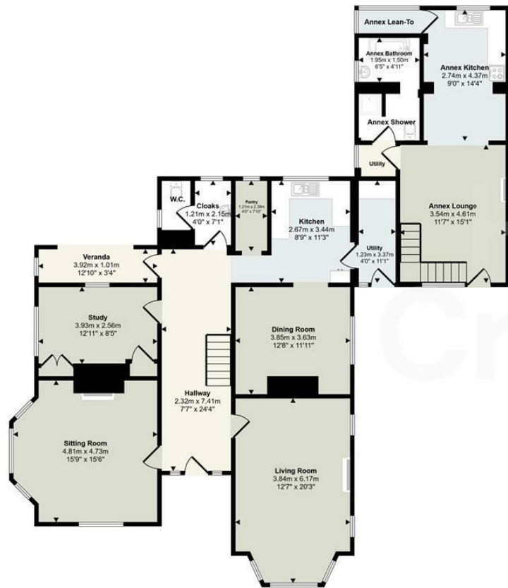
Ground Floor Approx 159 sq m / 1708 sq ft

Approx Gross Internal Area 341 sq m / 3667 sq ft