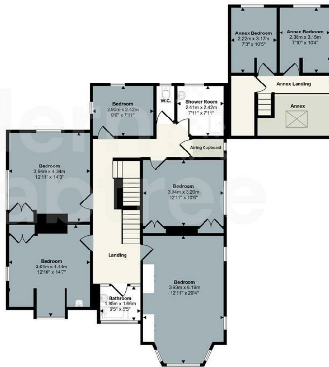
First Floor Approx 139 sq m / 1500 sq ft